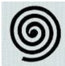
ccw- counter clockwise

Truly organic samples free from energetic impurities-- fruit, vegetables, meat, water, vital words, prayer, blessings, big 3, WL, +G, healing energy, Fung Shui, and chi gung healings emit a clockwise energy vortex. Happy foods spin clockwise.